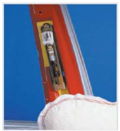
Seat belt height adjustment