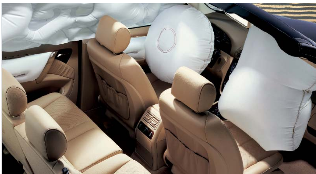
Demonstration of available airbags in the M-Class (W 163). The accident-specific circumstances determine which airbag(s), if any, will deploy.

On vehicles equipped with OCS, deactivation of the passenger front air bag can occur as a result of various factors, such as an empty seat or an occupant who does not meet a certain minimum weight, or foreign objects interfering with the system.