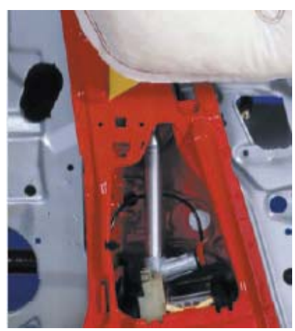
ETD in installation position

If the seat belt is also equipped with a seat belt force limiter, the limiter, when activated, helps to reduce the peak force exerted by the seat belt on the occupant. The seat belt force limiter is also designed to work with a deploying front air bag by providing more even distribution of occupant restraining forces between the seat belt and air bag.